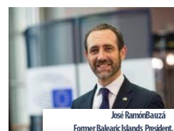
José Ramón Bauzá Former Balearic Islands President, MEP TRAN Coordinator, Tourism Task Force Chair